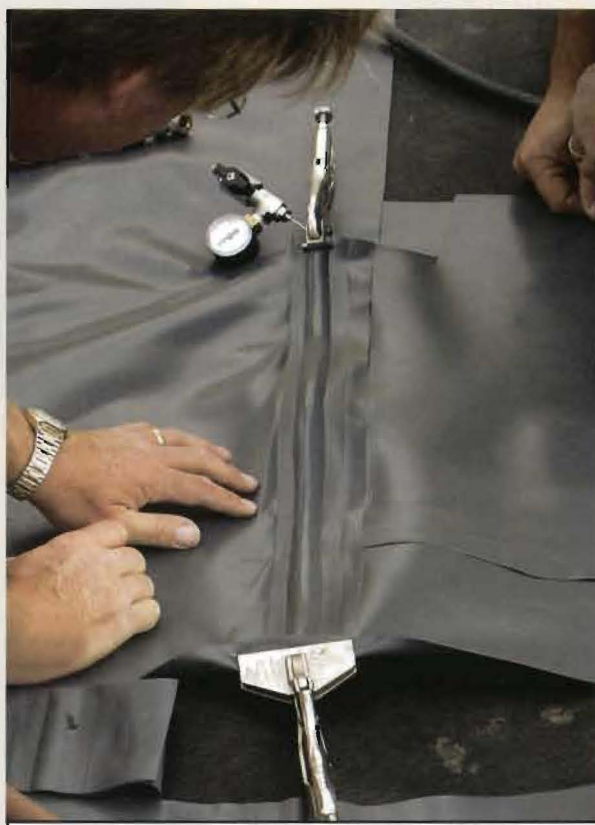
Photo 3. Air-channel testing of T seam in 30 mil sheet.