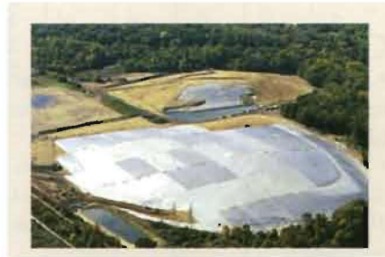
Photo 6. Two cells at Crown Vantage Landfill were lined with PVC geomembrane. The seams were air-channel tested using the procedure described in this article.

pile. Most of the panels for both cells were 30 m wide and 60 m long. Over 7,000 meters of field seam were required to weld the 70 together for the cell. While this amount of field seaming is significant, the length is about 70% less than the approximately 22,875 meters that would have been required