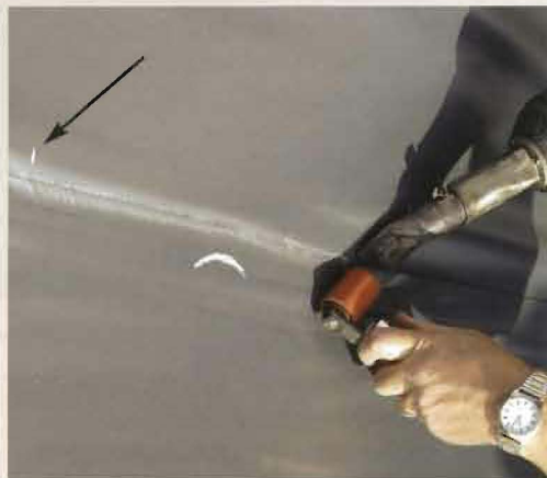
Photo 5. Hot air welding the upper flap of the geomembrane six inches above and below (see small tic mark near arrow) an aneurysm (large mark on sheet).

ing the 30 second or greater holding period for a 30 mil PVC geomembrane. Table 1 presents the allowable air-channel pressure drop for other thicknesses of PVC geomembrane.