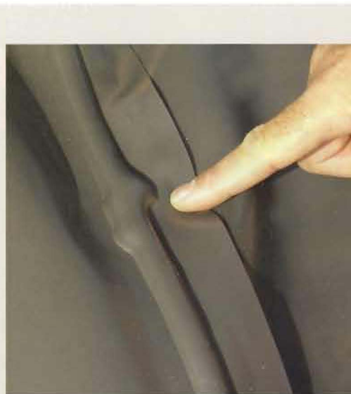
Photo 4. Aneurysm in 30 mil PVC geomembrane seam.

Of course, the air-channel can be pressurized beyond the required value. Because of changes in weather conditions during the test and low elongation of the PVC material that can occur during the test, the air-channel pressure can change 35 kPa (5 psi) dur-