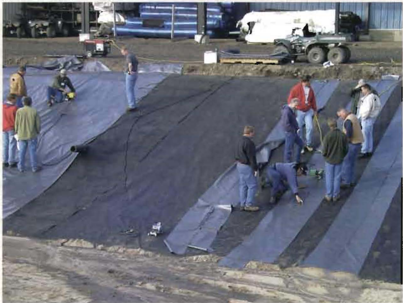
Photo 1. Wedge welding and air-channel testing area at the PGI workshop.

PVC affords the installation contractor the luxury of using three proven seaming methods: chemical fusion, hot wedge or hot air welding. The hot wedge and hot air welding can be performed using a single- or dual-track wedge. Each seaming method has proven itself viable in the field. This versatility of PVC within all of the industries that it has serviced over the past four